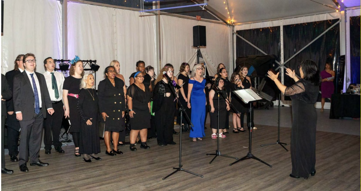
Figure 6. The STEP VA All-Abilities Choir performing at the Gala